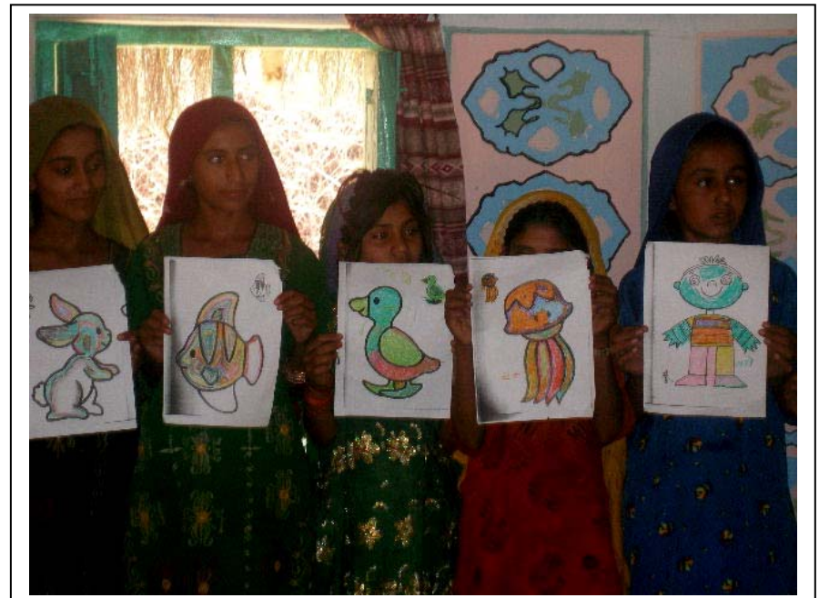
Girls of Village Meenhro showing their drawings

We are very happy, we can draw good pictures and colour them. We want to send picture to our friends of Spain and they will be very happy to see our work. We want to make good pictures for ever with colourful pencils we want to draw trees but in our village people cut the trees. We can not go out for this